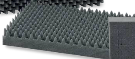
PU-foam with naps